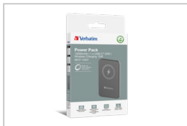
32249 - Packaging 3D