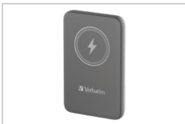
32249 - Front Angled